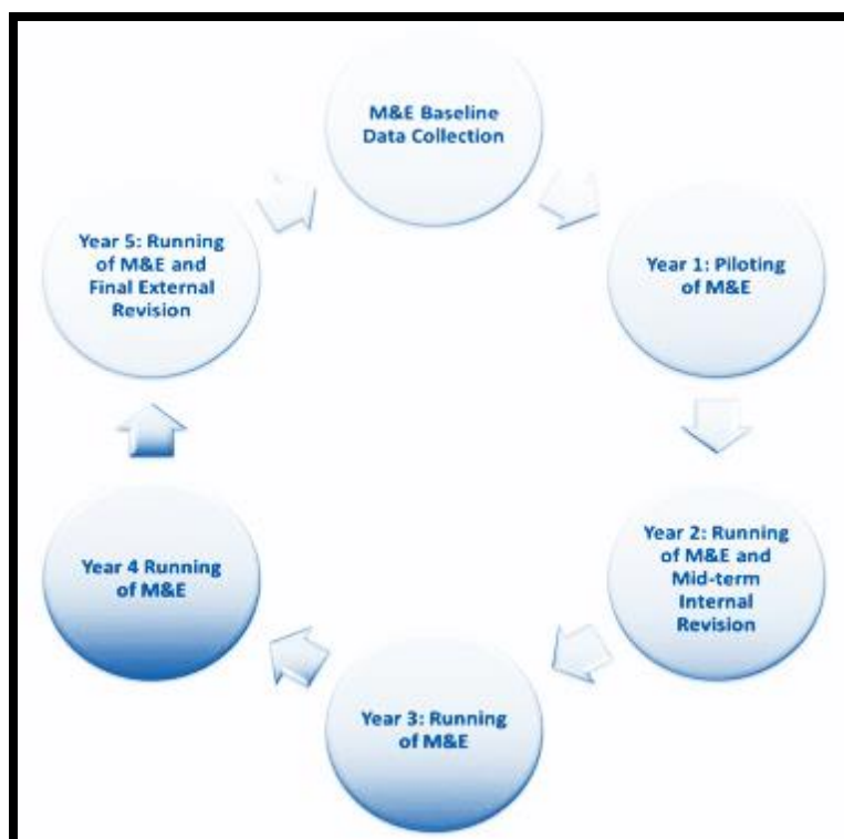
Figure 1: The SADC TFCA M&E Framework cycle