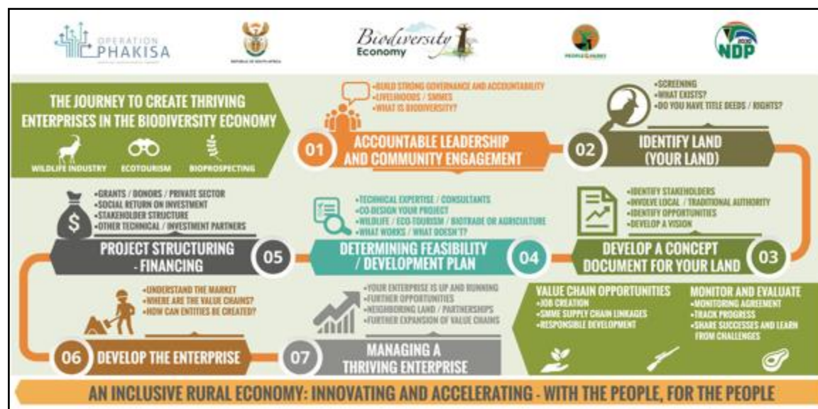
Figure 2: South Africa Biodiversity Economy Pathway

This presentation was delivered by Roland Vorwerk of Boundless Southern Africa.